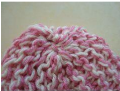
(Finished top of the hat)