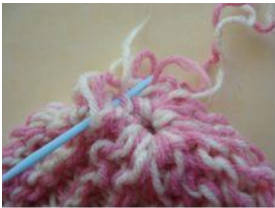
(Gather tightly and secure.)