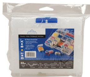
Dot Box Storage System 32 Pieces - Small, 7" X 5.5" X 1.5"