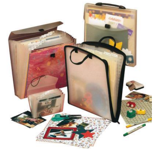
Scrapfolio Expandable Storage Case – Frost, 12" X 12"