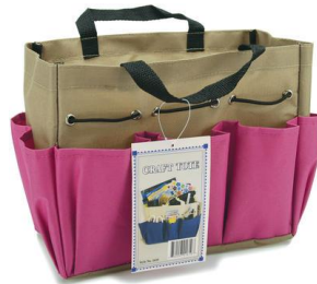
Project Tote, 9-1/2" X 8-1/2" X 5" - Bright Pink/Khaki