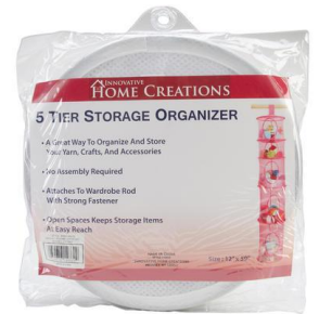
5 Tier Storage Organizer, 12" X 59" - White