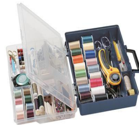
ArtBin Double Take Storage Case - 13.5" X 10" X 3.75"