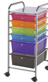
Storage Cart w/6 Drawers - Multi-Color