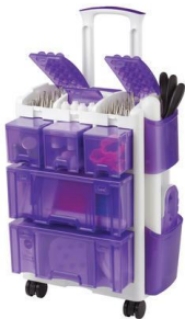
Decorate Smart Ultimate Rolling Tool Caddy, 10" X 14.2" X 22.5" - White/Purple