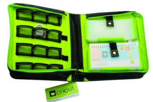
Cricut Cartridge Storage