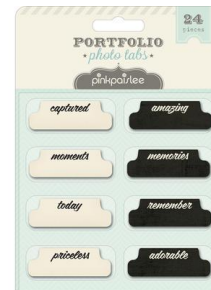
Portfolio Photo Tabs - 24/Pkg