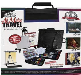
All Media Travel Artist Kit With Storage Bag-96 Pieces

Here are some great products for those who want to organize their crafting space! We have storage pins, yarn holders, books and more. You can find them all right here! Be sure to check out our full collection of crafty storage supplies at CutRateCrafts.com!