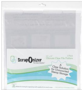
ScrapOnizer Ultimate File Folders, 2/Pkg – 12" X 12"