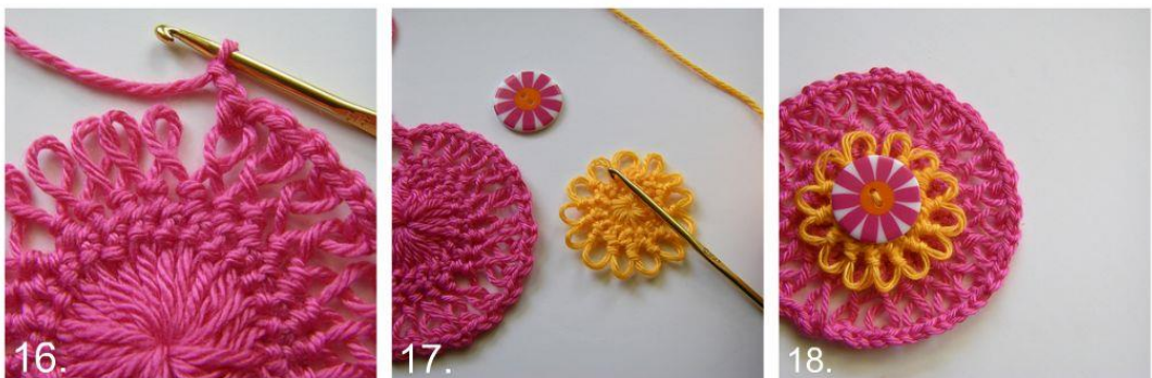
Pic 18: A Hairpin Rosette